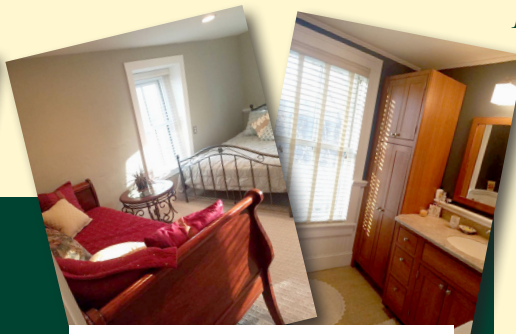
PENNY LANE Junior Suite with queen bed and daybed (sleeps 3)