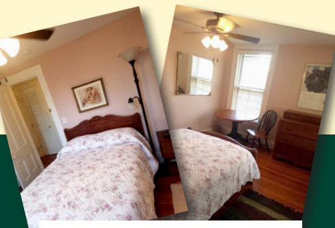
STRAWBERRY FIELDS Single Room with antique bed (sleeps 2)